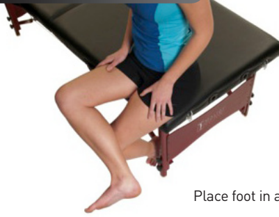
Place foot in a neutral position.